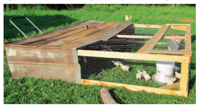
Figure B1. Chicken tractor design with recycled tin roofing