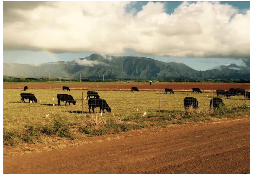
Kunoa Cattle Co. – P2P recipient.