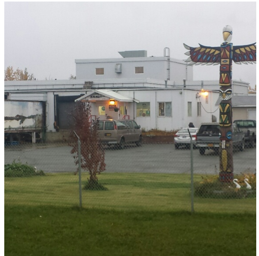
Mt. McKinley Meats in Alaska – P2P recipient.

All benefited from the wisdom of the experienced processors.