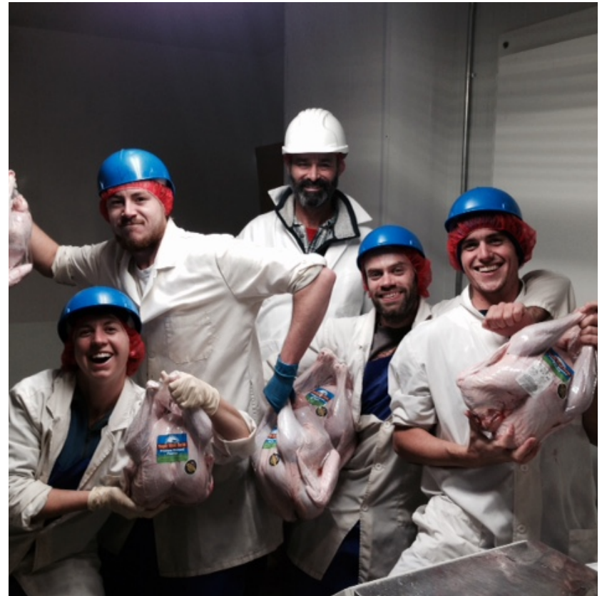
The crew at Maple Wind Farm in VT (P2P recipient).

Some matches became ongoing Mentor/Mentee relationships. Others were short and sweet: a phone call or two to solve one specific problem.